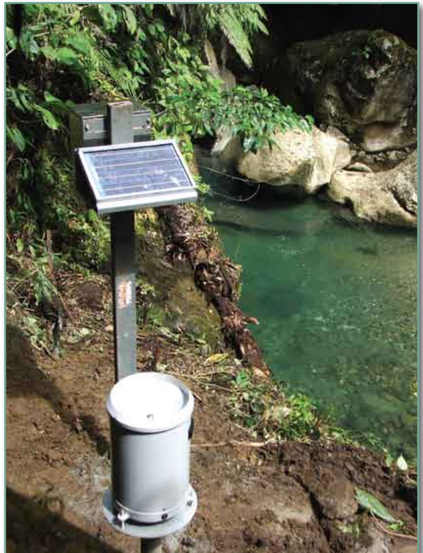
A gauging station installed with RSS (Rising Stage Sampler) posts at the lower end of the catchment. ASG environment staff service and download station on a monthly basis.