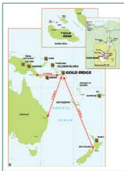
Map of the Solomon Islands

The Gold Ridge project is an advanced stage gold project located on the island of Guadalcanal in the Solomon Islands. The Gold Ridge project is operated on the island of Guadalcanal, the central island of the Solomon Islands, approximately 30km South East of the capital city Honiara.