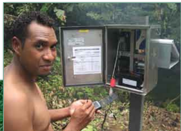
ASG Geologist downloading a logger through PDA.