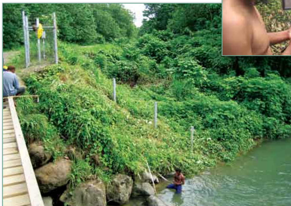
A completed gauging station high in the catchment area.

*A rating table or curve is a relationship between stage and discharge at a cross section of a river/run-off channel.